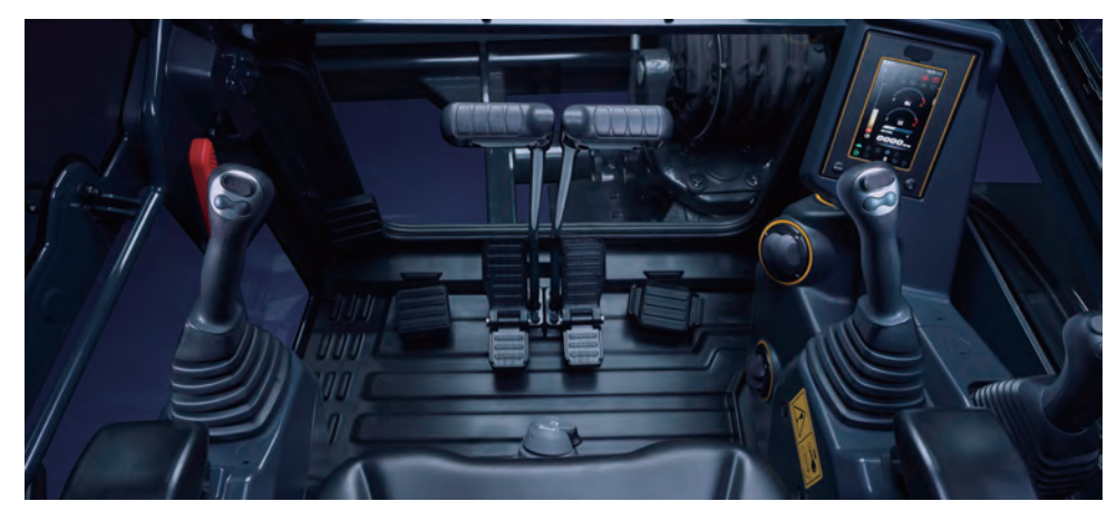
^{\star} Cab shown is for models HX35Az – HX48Az only

The cabs on the new compact excavators were designed with operator comfort and convenience in mind, with more space and more glass for better visibility to the worksite. Improved ergonomics and advanced features allow operators to work with greater ease and efficiency. The more spacious interior design not only makes operators more comfortable, but also improves safety by ensuring they can work for extended periods with less fatigue.